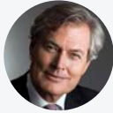
Gunter Pauli Serial Entrepreneur